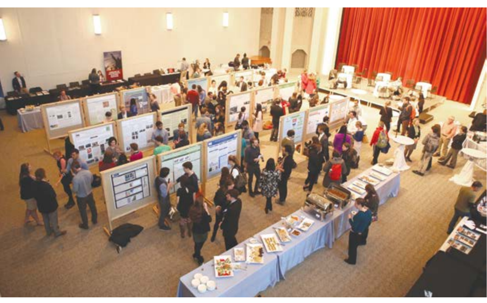
Our 2017 poster session featured an array of interdisciplinary research by conference participants.

"At the Alvin H. Baum Family Fund, we work to ensure healthier, more equitable, and safer lives for our fellow Chicagoland residents. We recognize global climate change and its consequences will lead to profound economic disparity, resource scarcity, and a forever altered ecosystem. Through timely information, shared strategies and inspired speakers, the climate change conference reveals the interconnection between the cultural, economic, political, and scientific systems. With insight like this—we are armed to tackle this wicked problem."