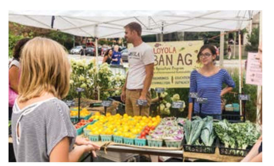
The Urban Agriculture Program sells its produce at the Loyola Farmers Market.

IN GRANT DOLLARS AWARDED TO STEP OR IES PROGRAMS THAT BEGAN IN STEP