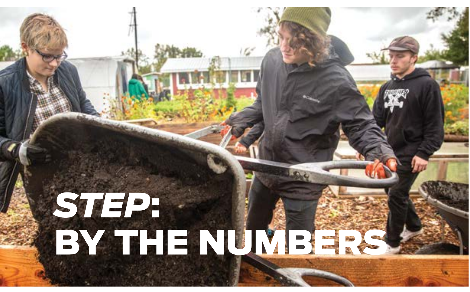
IES students use their compost in neighborhood raised beds.